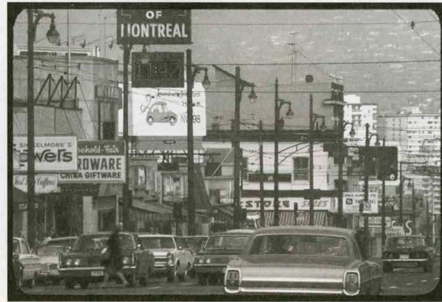
Robbert Flick, 10th Avenue and Granville, looking North , 1967 (original in colour).